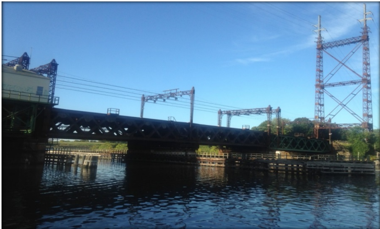
Figure 1-2—View of Walk Bridge, looking northeast

The deteriorating condition of Walk Bridge has been extensively documented over the years. 6 A detailed fatigue analysis was completed in 2005, and it indicated that major portions of the bridge have exceeded their fatigue life and require replacement. CTDOT performs maintenance and repairs on the bridge's structural, mechanical, and electrical systems on regular basis.